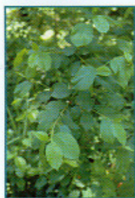
Glossy Buckthorn - Rhamnus frangula

Both shrubs can reach 20' tall and have dark bark with silvery marks called lenticels. Common buckthorn has dull, green, toothed-edged leaves and female plants have dark fruits in fall and winter. The Glossy's leaves are untoothed and shiny on top.