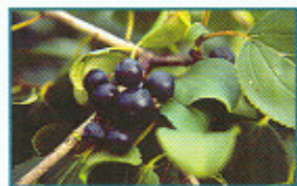
Common Buckthorn - Rhamnus cathartica

Buckthorn cuts off sunlight to tree seedlings limiting forest regeneration and shades out native understory vegetation.